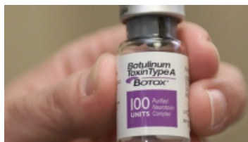
A bottle of Botox is seen at a doctor's office in Beverly Hills, Calif., March 20, 2002.